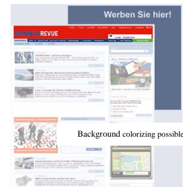
Wallpaper Size: Superbanner and Skyscraper CPM*: 150.00 €