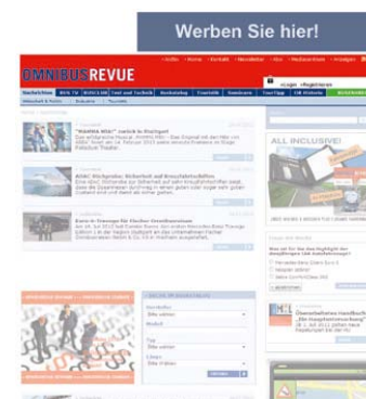
Superbanner Size: 728 x 90 px