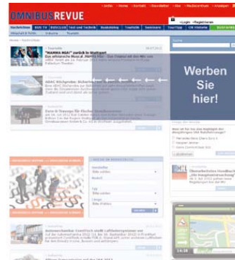
Expandable Medium Rectangle Small Size: 300 x 250 px 630 x 250 px