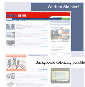
Wallpaper Size: Superbanner and Skyscraper CPM*: 150.00 €