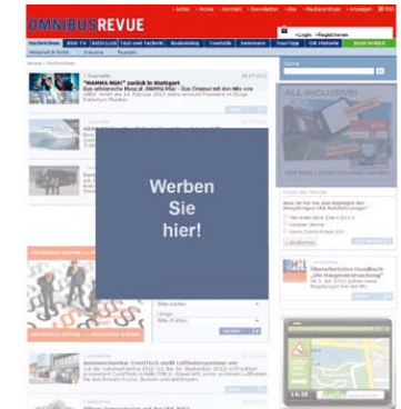
Flash Layer and Medium Rectangle Reminder (Tandem Ad) Size: 400 x 400 px 300 x 250 px