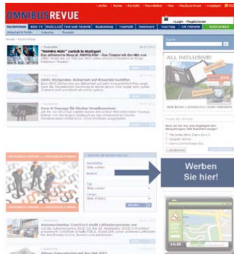
Text Display Small Size: 300 x 115 px