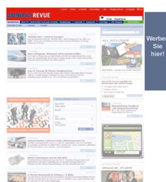
Skyscraper Size: 120 x 600 px 160 x 600 px CPM*: 75.00 €