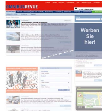
Expandable Medium Rectangle Large Size: 300 x 250 px 630 x 350 px