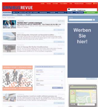
Half Page Size: 300 x 600 px