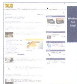
Skyscraper Size: 120 x 600 px 160 x 600 px