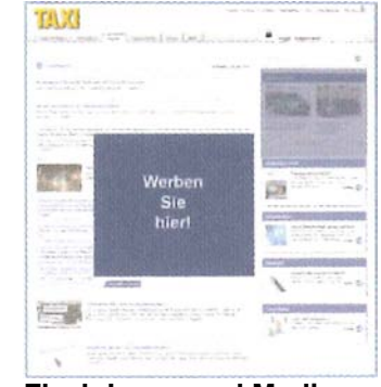
Flash Layer and Medium Rectangle Reminder (Tandem Ad) Size: 400 x 400 px 300 x 250 px