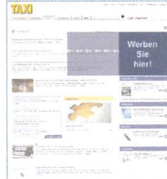
Expandable Medium Rectangle Small Size: 300 x 250 px 630 x 250 px