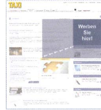
Expandable Medium Rectangle Large Size: 300 x 250 px 630 x 350 px