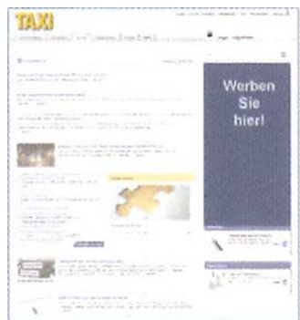
Half Page Size: 300 x 600 px