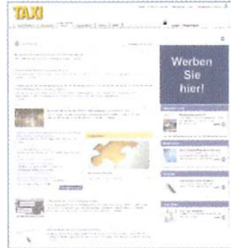
Medium Rectangle Video Medium Rectangle Size: 300 x 250 px