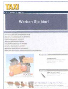
Cross-/Full-Size Banner Text Display Large