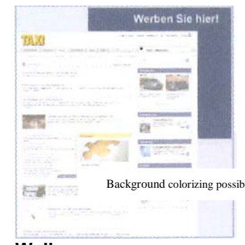
Wallpaper Size: Superbanner and Skyscraper