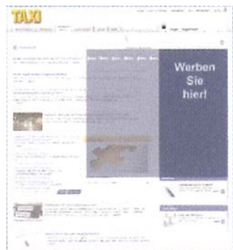
Expandable Half Page Size: 300 x 600 px 630 x 600 px