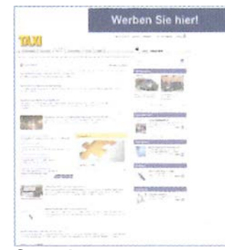
Superbanner Size: 728 x 90 px