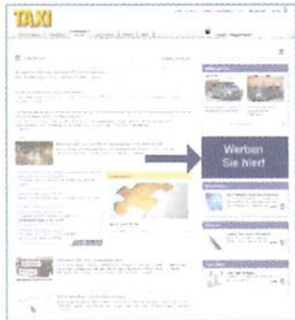
Text Display Small Size: 300 x 115 px