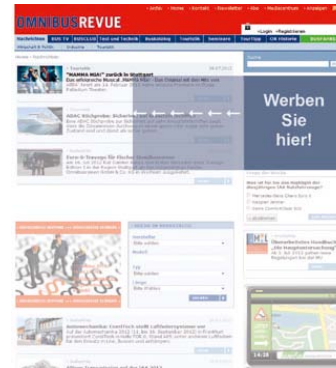
Expandable Medium Rectangle Small Size: 300 x 250 px 630 x 250 px