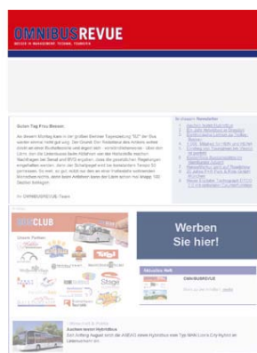
Text Display Small

Newsletter subscribers: 2,172 (July 2012)