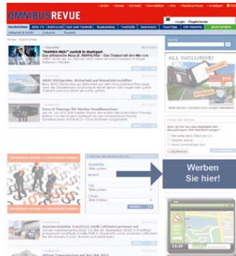
Text Display Small Size: 300 x 115 px