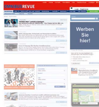
Medium Rectangle Video Medium Rectangle Size: 300 x 250 px