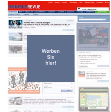
Flash Layer and Medium Rectangle Reminder (Tandem Ad) Size: 400 x 400 px 300 x 250 px