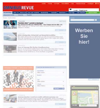
Half Page Size: 300 x 600 px