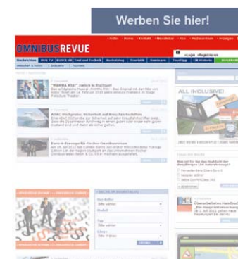
Superbanner Size: 728 x 90 px CPM*: 75.00 €