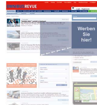
Expandable Medium Rectangle Large Size: 300 x 250 px 630 x 350 px