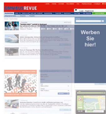
Expandable Half Page Size: 300 x 600 px 630 x 600 px Price on request