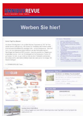
Cross-/Full-size banner Text display large

Size: 300 x 250 px Fixed Price: 199.00 €