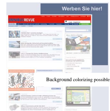
Wallpaper Size: Superbanner and Skyscraper CPM*: 150.00 €