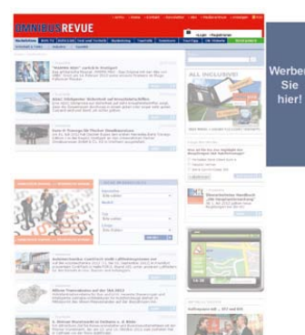
Skyscraper Size: 120 x 600 px 160 x 600 px CPM*: 75.00 €