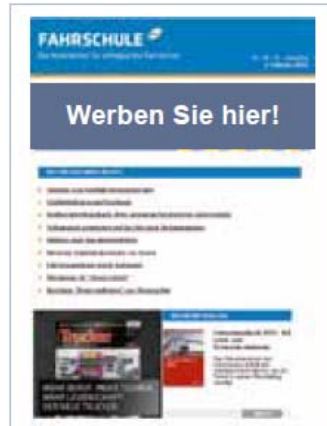
Cross/Full-Size Banner Text Display Large

Size: 300 x 250 px Fixed Price: 249.00 €