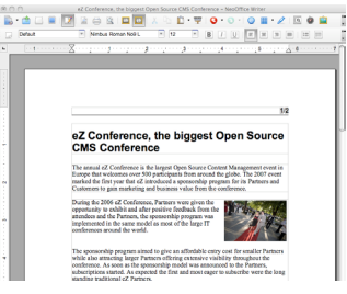
Integrate with standard word processing applications