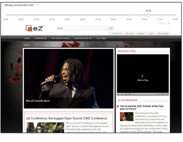
Preview your portal pages with the time slider