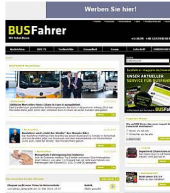
Superbanner Size: 728 x 90 px CPM*: 75.00 €