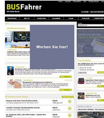
Flash Layer and Medium Rectangle Reminder (Tandem Ad) Size: 400 x 400 px 300 x 250 px