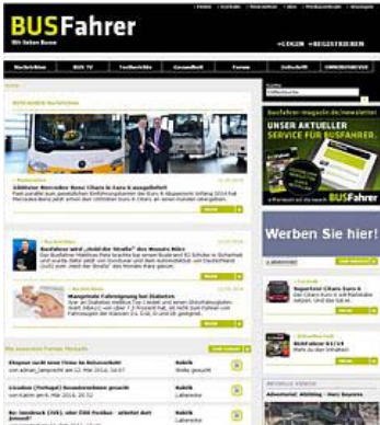
Text Display Small Size: 300 x 115 px