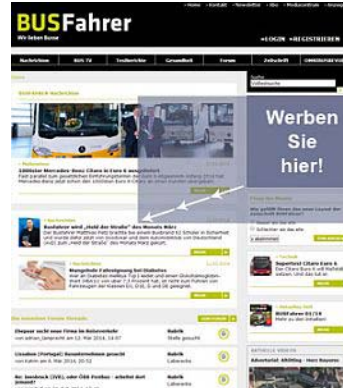
Expandable Medium Rectangle Large Size: 300 x 250 px 630 x 350 px