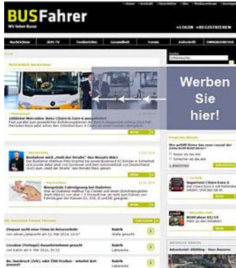
Expandable Medium Rectangle Small Size: 300 x 250 px 630 x 250 px