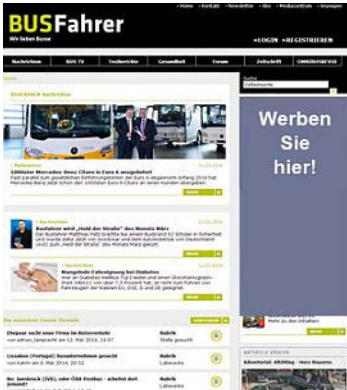
Half Page Size: 300 x 600 px