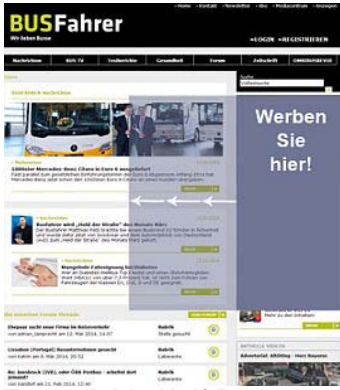
Expandable Half Page Size: 300 x 600 px 630 x 600 px Price on request