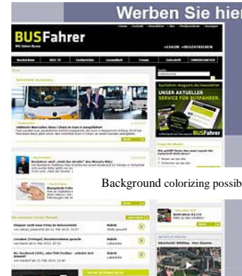
Wallpaper Size: Superbanner and Skyscraper CPM*: 150.00 €