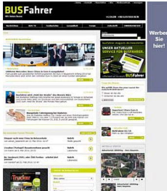
Skyscraper Size: 120 x 600 px 160 x 600 px CPM*: 75.00 €