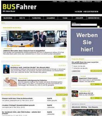
Medium Rectangle Video Medium Rectangle Size: 300 x 250 px