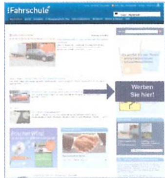
Text Display Small Size: 300 x 115 px