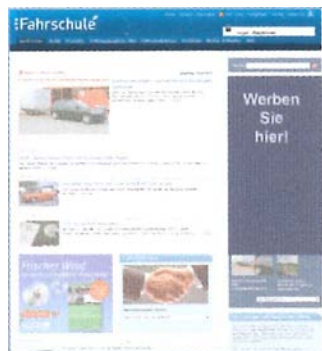
Half Page Size: 300 x 600 px