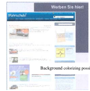
Wallpaper Size: Superbanner and Skyscraper