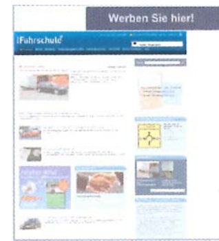
Superbanner Size: 728 x 90 px