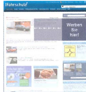
Expandable Medium Rectangle Small Size: 300 x 250 px 630 x 250 px