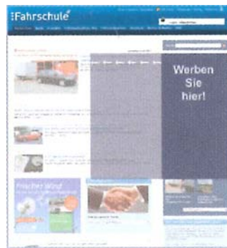
Expandable Half Page Size: 300 x 600 px 630 x 600 px