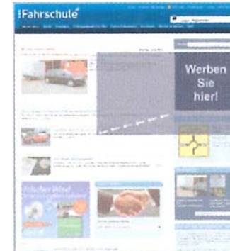
Expandable Medium Rectangle Large Size: 300 x 250 px 630 x 350 px