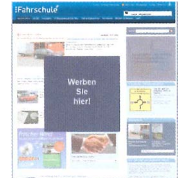
Flash Layer and Medium Rectangle Reminder (Tandem Ad) Size: 400 x 400 px 300 x 250 px