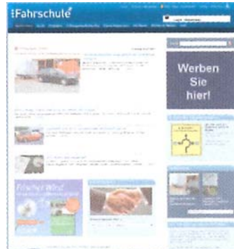
Medium Rectangle Video Medium Rectangle Size: 300 x 250 px