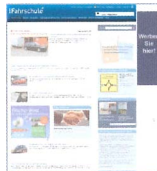
Skyscraper Size: 120 x 600 px 160 x 600 px